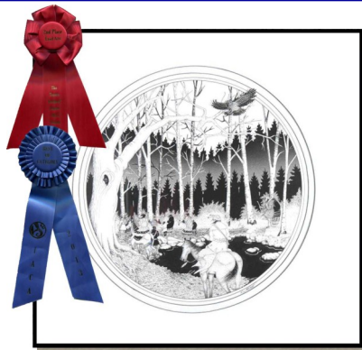
"We Will Not Forget, Trail Of Tears"