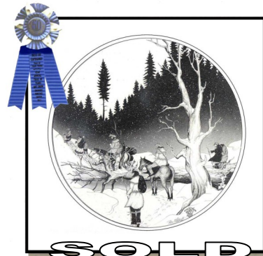
"Trials & Tribulations"